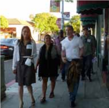
Concierge Fam Tour

"The neighborhood is filled with hidden jewels for locals and visitors to explore. Tacos & sushi were awesome at Juan Chou! I don't own any pets but how neat to see pets being pampered with blueberry scrub at South Bark Dog. Enjoyed the ambiance and selections at Rose Wine Pub. Alchemy offers a nice modern spin on healthy & organic fare. Vagabond is such a worldly eclectic blend of taste around the country. Dining here is like having a passport to explore the best finds for must see destinations. I definitely fell in love, over and over."