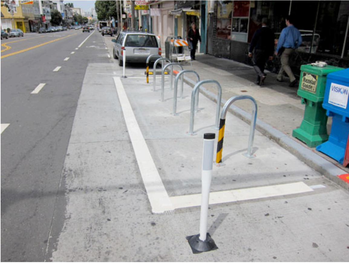
Street Bike Parking Example