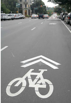
Sharrow road marking example

In an effort to further increase public awareness, we recommend that all Class II and III routes be clearly marked with sharrow-pavement markings as is shown in the below example. Sharrow is a term coined by Oliver Gajda, of the City and County of San Francisco Bicycle Program; this marking is used within travel lanes shared by bicyclists and other vehicles.