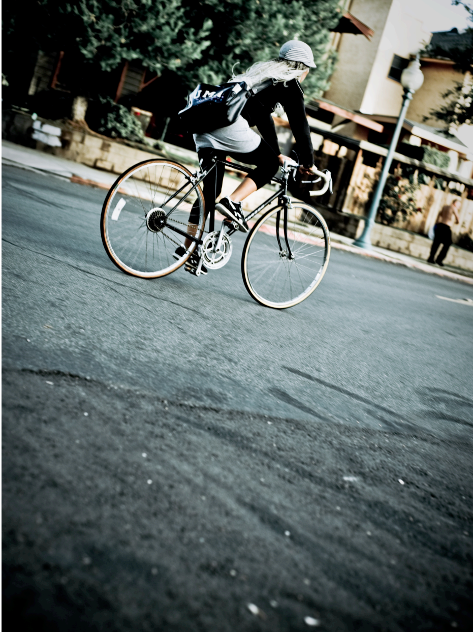
Cyclist on 30 th near Beech Street - of course she is wearing a helmet.

A community plan for the City of San Diego's Bicycle Master Plan Update as envisioned and presented by the South Park Business Community